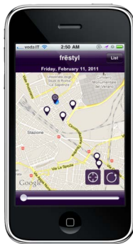
Figure 3. frēstyl's iPhone application: events on the map.

Among the features that will be implemented within frēstyl in the following months are: improvement of social connections, upgrade of the mobile applications and socially-based recommendations.